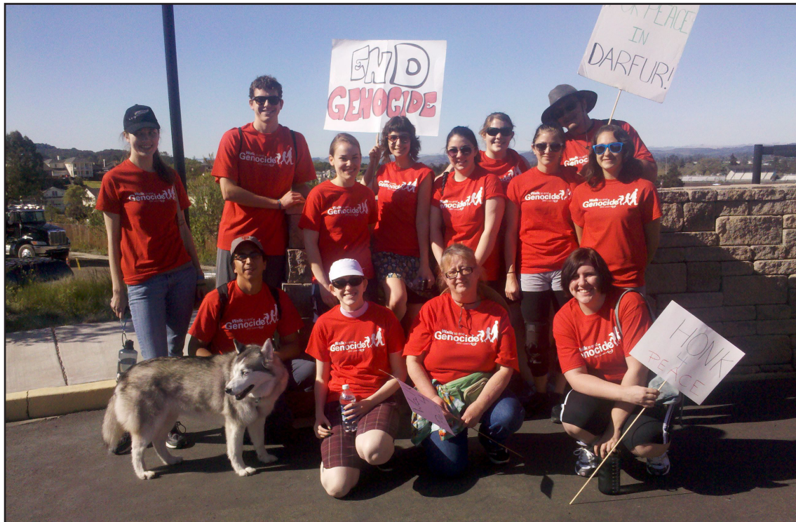
Jewish World Watch 5th Annual Walk To End Genocide, Santa Rosa

A treasure trove of past Holocaust and Genocide Lectures are archived and available for viewing via YouTube and Streaming Video from the Center Website: http://www.sonoma.edu/holocaust/lectures/index.html . Click on Previous Lecture Series Schedules to the Video Archives link.