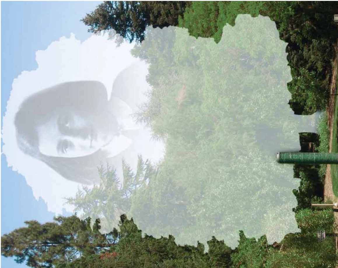
An imagined view of the Anne Frank horse chestnut tree at maturity that would provide canopy at the Holocaust and Genocide Memorial Grove.

Address corrections or deletions can be requested using the enclosed donation envelope or via e-mail to alliance@sonoma.edu . Those interested in receiving information re: special events via e-mail should forward name and e-mail address to alliance@sonoma.edu .