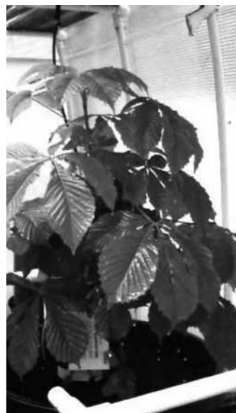
Sapling is thriving in 2011

Other saplings were sent to: The White House, The Children's Museum of Indianapolis, Southern Cayuga School District, Washington State Holocaust Resource Center, Boston Common, Central High School in Little Rock, Ark., the Holocaust Memorial Center, the Idaho Anne Frank Human Rights Memorial, the William J. Clinton Foundation and the National September 11 Memorial & Museum.