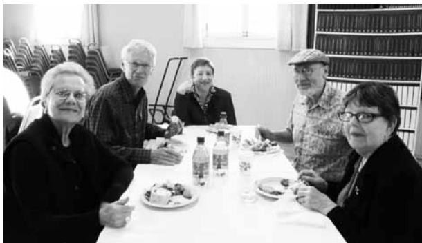
Harris Memorial Lecture Reception Guests