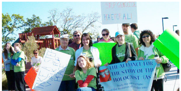
JWW Walk to End Genocide: Alliance and SSU Students