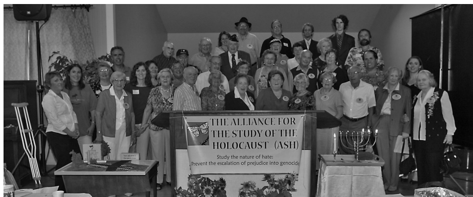
Survivors & Children and Grandchildren of Survivors (9/17/06 Event).

We do hope you are as excited as we are about the 2007 series.