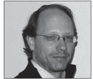
Sergio La Porta Lecture 2/19/19