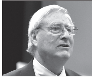
Christopher Browning Lecture 2/5/19